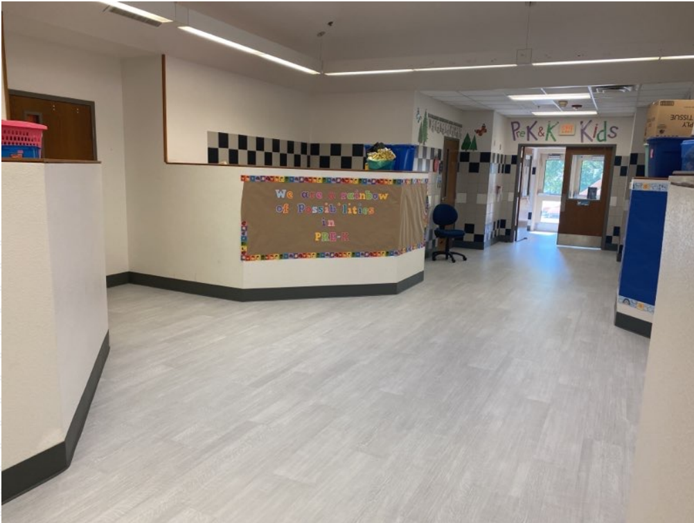
Hallway F Looking East